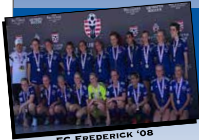
FC FREDERICK '08

...AND TO THE FCF'04 & '08 GIRL'S FOR BEING STATE CUP CHAMPS & THE '08 GIRL'S ON BEING AN EASTERN REGIONAL FINALIST!