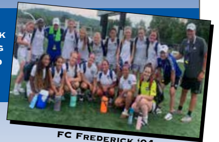
FC FREDERICK '04